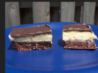
Nanaimo bar (Canada)