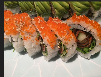
B. C. roll (Canada)