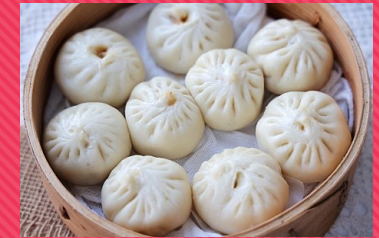
Tianjin Xiao Long Bao (China)