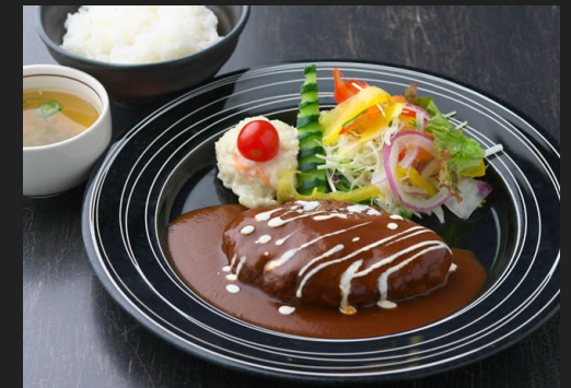
ingredients provided at a roadside station