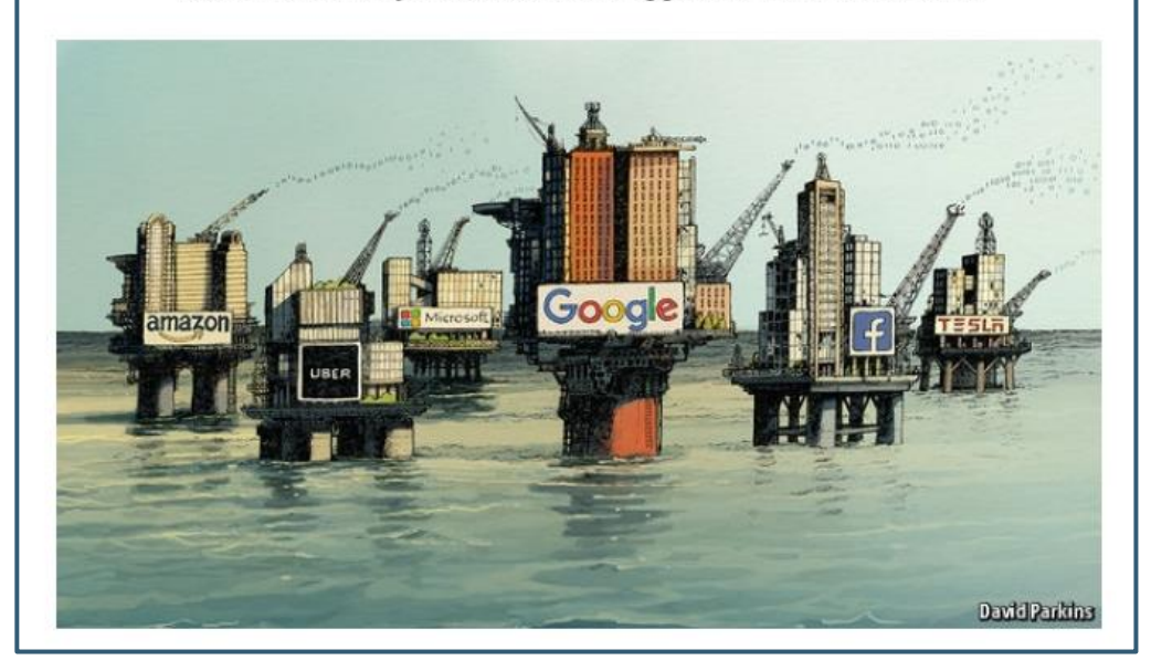
The Economist, 6. Mai 2017

The data economy demands a new approach to antitrust rules