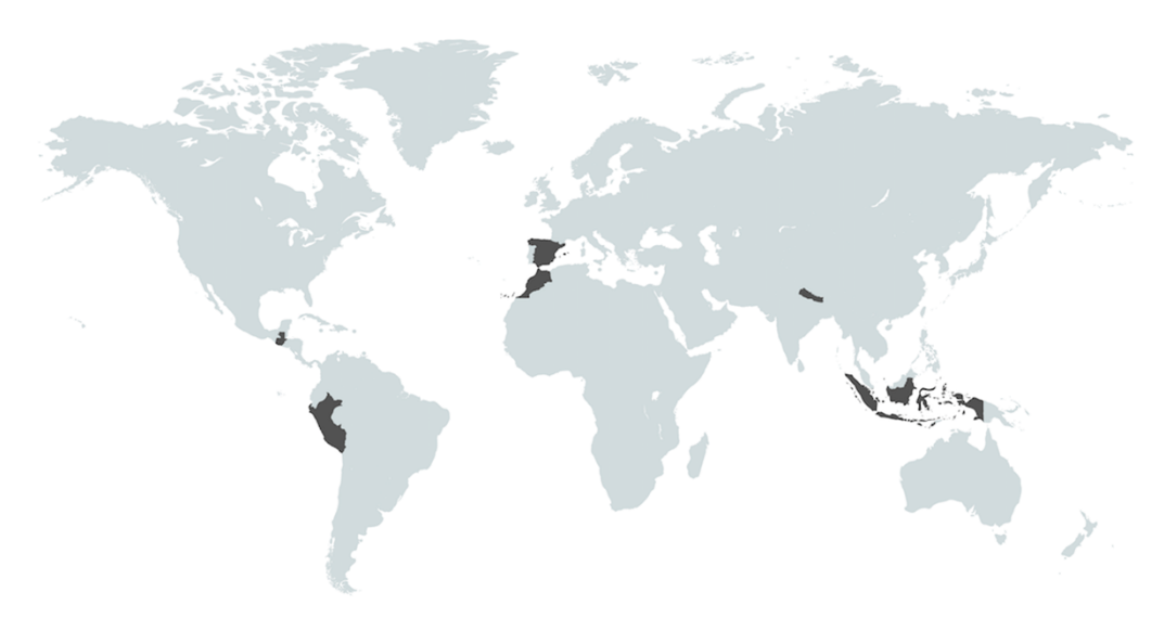
Guatemala, Peru, Morocco, Nepal, Indonesia