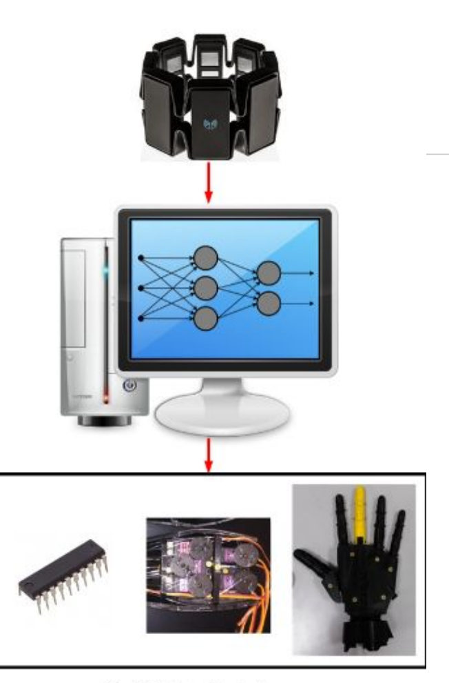
Fig. 2. System block diagram.