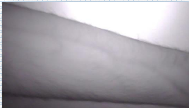
The Raw NIR image of forearm.