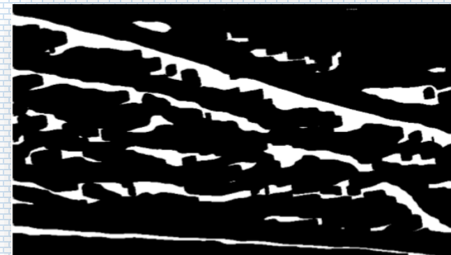
The Processed NIR image of forearm.